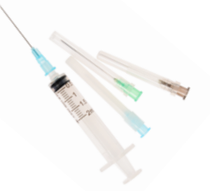
Home-generated needles & syringes