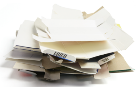
Flattened cardboard & paperboard