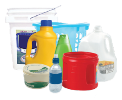
Plastic bottles & containers