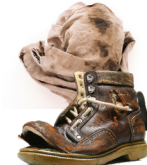
Clothing, shoes, blankets