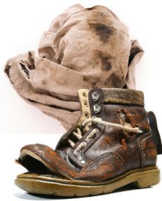
Clothing, shoes, blankets