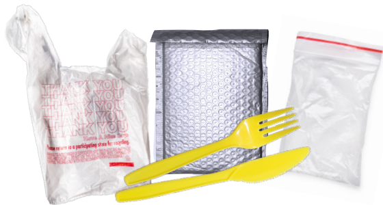
Plastic bags, utensils, film plastics