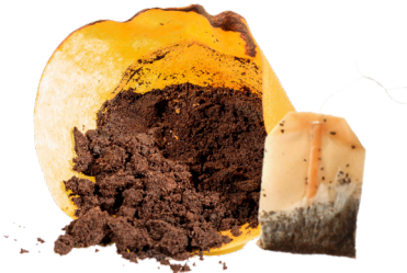
Coffee grounds, paper filters, tea bags