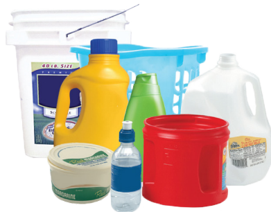
Plastic bottles & containers