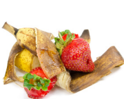
Fruits & vegetables