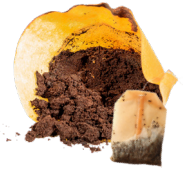
Coffee grounds, paper filters, tea bags