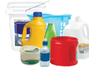
Plastic bottles & containers