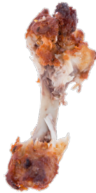
Meat scraps & bones