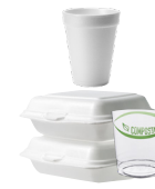
Styrofoam™, compostable plastic