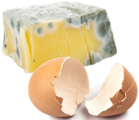
Dairy & eggs