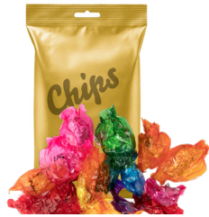
Chip bags & candy wrappers