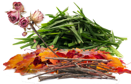
Leaves, yard trimmings, clean wood scraps (4" diameter or less)