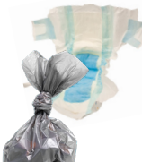
Pet waste, diapers