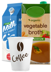
Coated paper & cartons