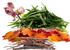
Leaves, yard trimmings, clean wood scraps (4" diameter or less)

Layer food scraps with food-soiled paper/yard trimmings or use paper bags/ BPI-certified (ASTM D6400) compostable bags for food scraps collection.