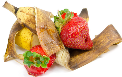
Fruits & vegetables