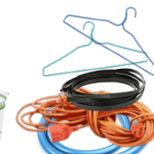
Hoses, cords, chains, clothes hangers