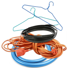
Hoses, cords, chains, clothes hangers