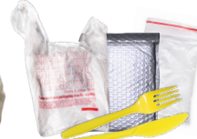
Plastic bags, utensils, film plastics