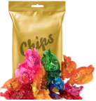
Chip bags & candy wrappers